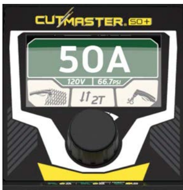
Simple and intuitive TFT LCD panel